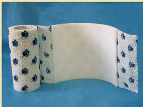
All-in-One absorbent foam pad and dressing