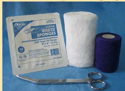
Traditional bandaging method requires a variety of products.